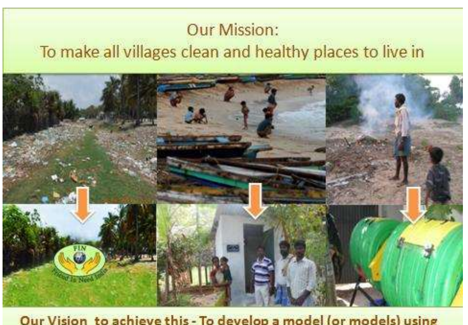
Framework 1: FIN's mission

- facilitating WASHE transitions to Green and Clean environments both within and outside of Kameswaram in India and other developing countries.