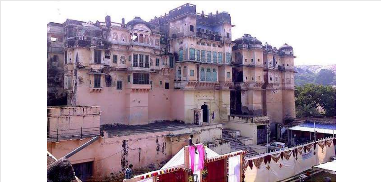
Figure 11: An old Rajsthani palace

I like taking part in different activities apart from studies. I am a part of our college's NSS team and I also participate in various technical and sports fest. I am good at anchoring events. I always participate in group discussions and debates. This really helps me to understand the perspective of others. Though I do not enjoy reading books I always try my best. It increases my vocabulary and enhances my interaction style to a great extent. I also like to keep myself updated with the latest news. I also love painting, swimming, and cooking. I've learned French at a basic level during my school days and I wish to continue it in the future. I consider French as a very interesting and easy to learn language, but has a huge grammar.