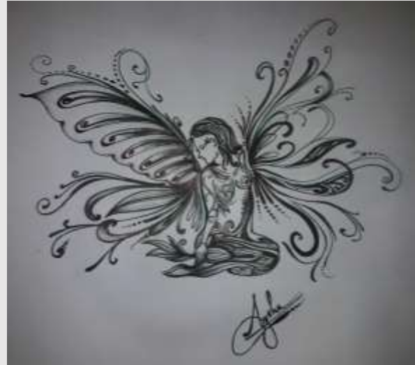
Figure 7: An illustration by drawn Ayswarya