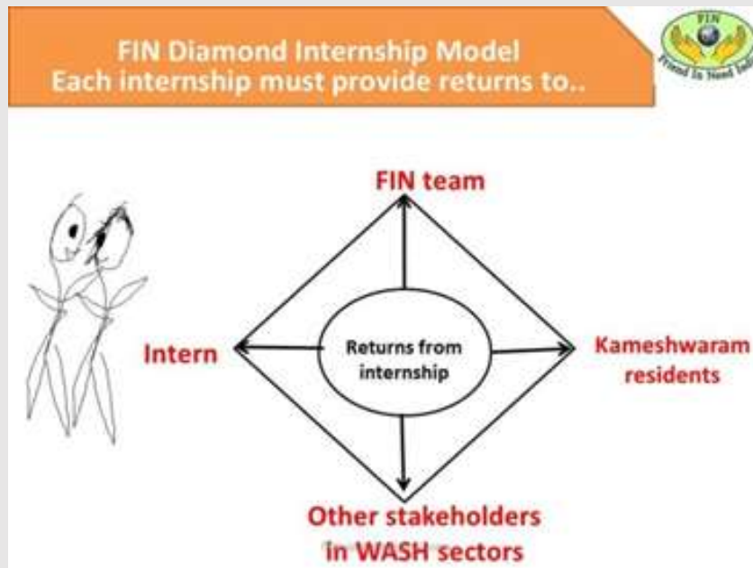
Figure 1: FIN Diamond Internship Model